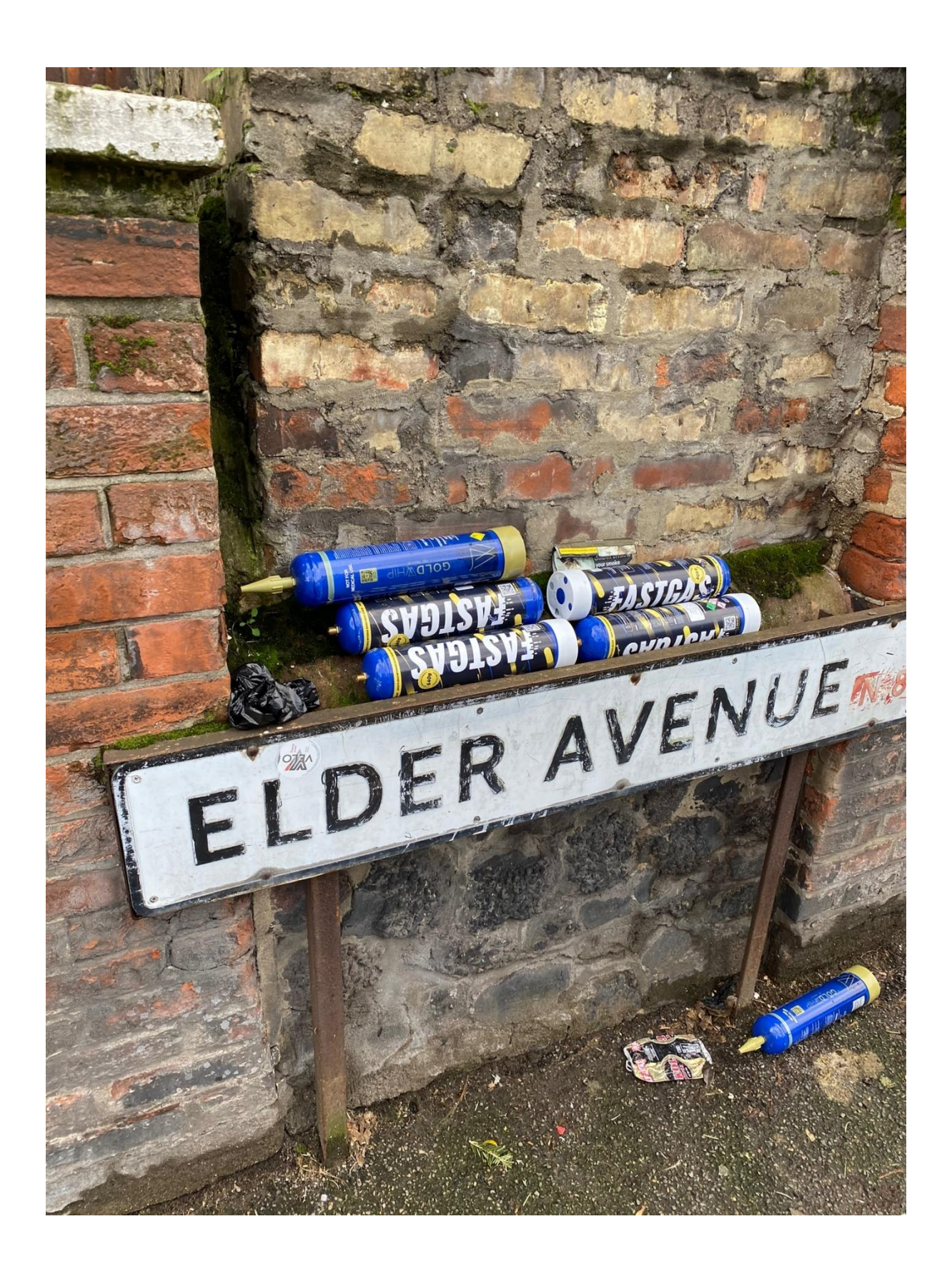
Litter on elder avenue close to shop